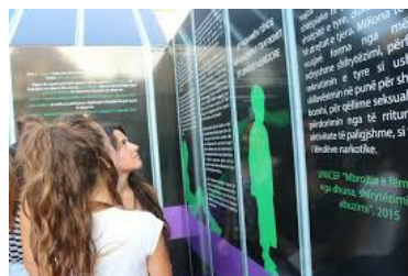
What you see inside

GIFT Box is a unique way to raise awareness about human trafficking and gather knowledge on the issue.