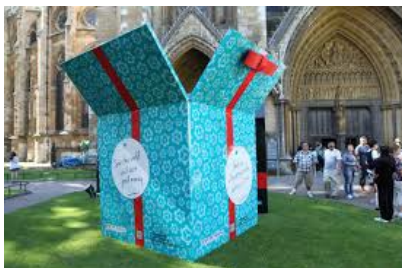
GIFT Box from outside