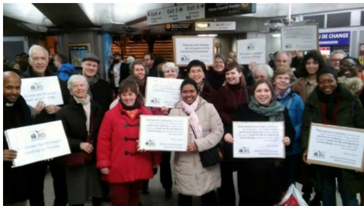
Holy Family Sisters join anti-Trump protest

my immediate response was that I must go; I must support this protest. As a Congregation, we have taken the option to put our energies and resources at the service of refugees and vulnerable people 'on the move'. So, with three of my sisters, I joined the members of JRS group who had gathered in protest. This is a vital part of the work of JRS; while accompanying and caring for the most destitute and