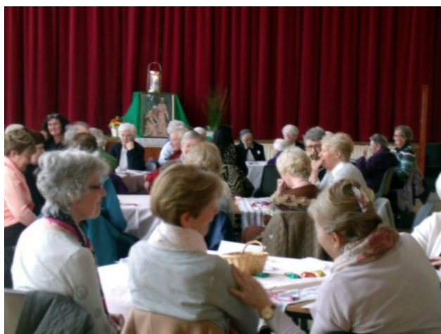
Gathering in Holy Family School Hall, Newbridge

united with members of a much wider Family throughout the world and that this “being in communion with our worldwide Holy Family” is what makes us who we are.