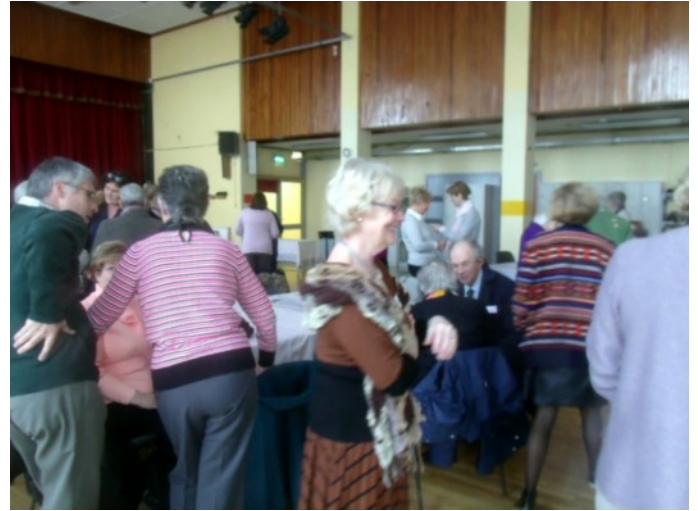
Getting to know one another

Before getting to that, however, time was given for the participants to mill around and get to know one another by chatting to those they did not know. The buzz in the room was great and it was with some difficulty that all were prevailed upon to take their seats again for the next part of the