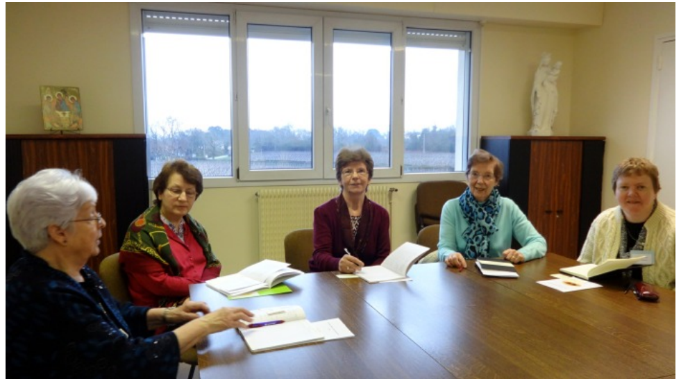
The Leadership Team of Britain and Ireland meeting in Martillac