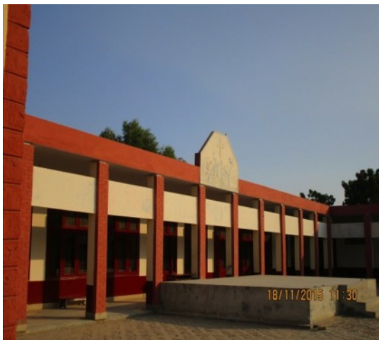
Holy Family School, Pakistan

A recent incident took place on 22 January 2016, when a Christian girl was killed after she and her two friends (Christian girls) shrugged off the advances of some young, drunken Muslim men from one of the elite areas of Lahore Defence colony. The families of the three girls demanded justice but, despite the cruelty of this brutal attack and death of an innocent girl, the police forced the parents to pay a bribe in order to have the FIR registered. There is very little hope that justice will prevail.