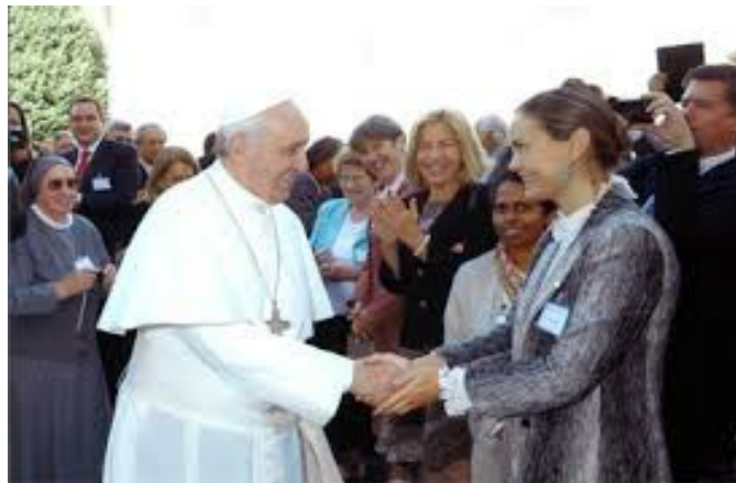
Pope Francis greets participants at Youth Symposium on Human Trafficking

not forgotten you; they are working for peace and justice for everyone everywhere. Don't be taken in by the messages of hatred or terror all around us. Instead, make new friends. Give of your time and always show concern for those who ask your help. Be brave and go against the tide; be friends of Jesus, who is the Prince of Peace (cf. Is 9:6). "Everything in him speaks of mercy. Nothing in him is devoid of compassion" (Misericordiae Vultus, 8).