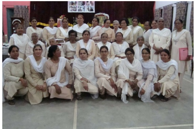
Sisters of the Unit of Pakistan

Although there were many happy occasions to celebrate, I was deeply disturbed to see and to hear the suffering our Christian people endure daily in different parts of Pakistan. Sad to say, many young girls are being targeted, abducted and forced to convert to Islam. According to one of the Muslim NGOs, "Movement of Solidarity and Peace", around 700 Christian women are abducted, raped and forced into Islamic marriages every year.