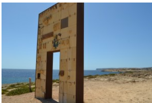
'Door of Europe' Monument

At 9.30 on the following Sunday, there was a moment of prayer and reflection on the theme of the World Day, "Migrants and Refugees challenge us. The Response of the Gospel of Mercy", at the Door of Europe , a monument dedicated to the memory of the drowned migrants.