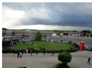
Racecourse and enclosure