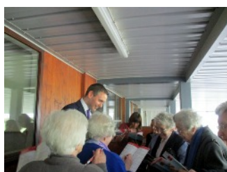
Studying form helped by an expert