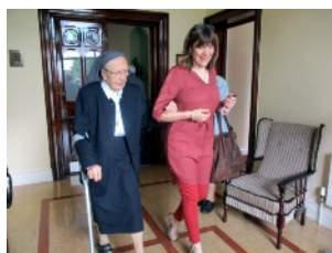
On our way...