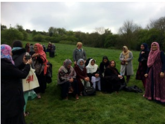
Tutors and Learners take a Field trip to admire the bluebells