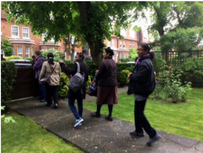
Setting out from Aberdare

other something of our life journey was indeed a means of getting to know each other better and strengthening our bond.