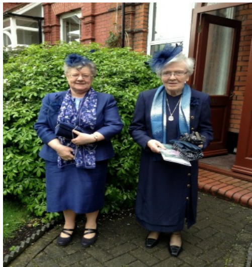
Ready to leave from St. Gabriel's Road