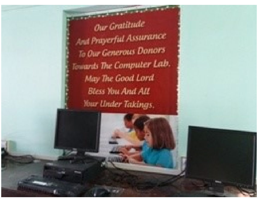
The children of Okara school use their new computers to say, "Thank You".