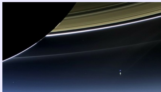
The pale blue dot that is planet Earth filmed from Cassini 800 million miles away

human conceits than this distant image of our tiny world. To me, it underscores our responsibility to deal more kindly with one another, and to preserve and cherish the pale blue dot, the only home we've ever known." Carl Sagan, Pale Blue Dot: A Vision of the Human Future in Space