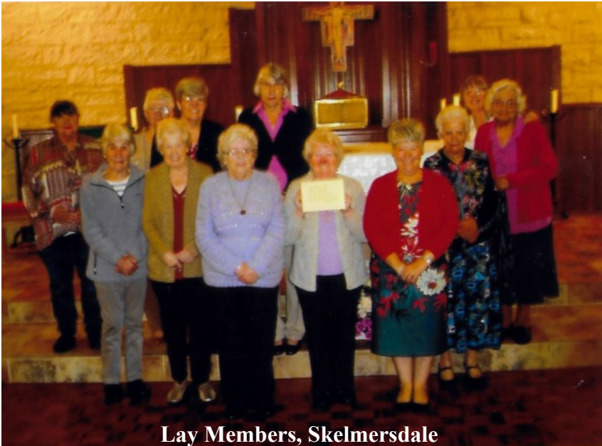
Lay Members, Skelmersdale