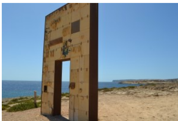
‘Door of Europe’ Monument

At 9.30 on the following Sunday, there was a moment of prayer and reflection on the theme of the World Day, “Migrants and Refugees challenge us. The Response of the Gospel of Mercy”, at the Door of Europe , a monument dedicated to the memory of the drowned migrants.