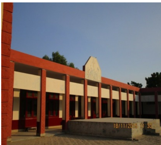
Holy Family School, Pakistan

A recent incident took place on 22 January 2016, when a Christian girl was killed after she and her two friends (Christian girls) shrugged off the advances of some young, drunken Muslim men from one of the elite areas of Lahore Defence colony. The families of the three girls demanded justice but, despite the cruelty of this brutal attack and death of an innocent girl, the police forced the parents to pay a bribe in order to have the FIR registered. There is very little hope that justice will prevail.