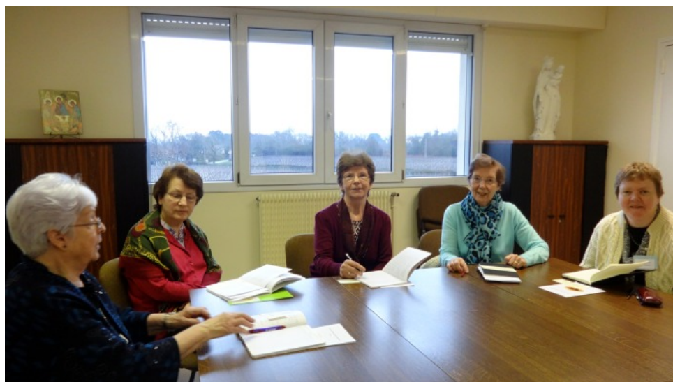
The Leadership Team of Britain and Ireland meeting in Martillac