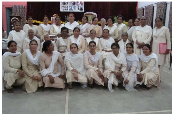
Sisters of the Unit of Pakistan

Although there were many happy occasions to celebrate, I was deeply disturbed to see and to hear the suffering our Christian people endure daily in different parts of Pakistan. Sad to say, many young girls are being targeted, abducted and forced to convert to Islam. According to one of the Muslim NGOs, "Movement of Solidarity and Peace", around 700 Christian women are abducted, raped and forced into Islamic marriages every year.