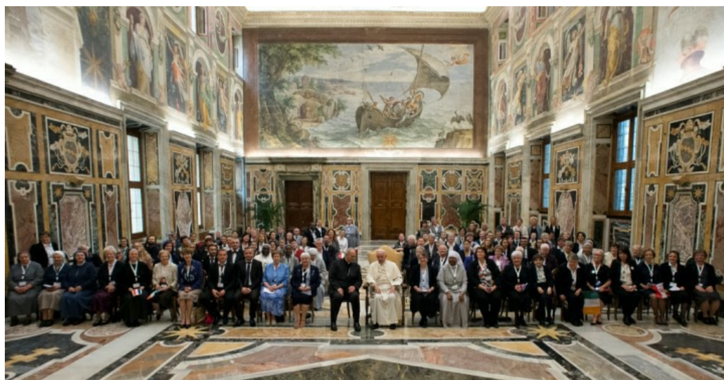
Pope Francis with RENATE Assembly participants, at the Vatican, 7 Nov. 2016