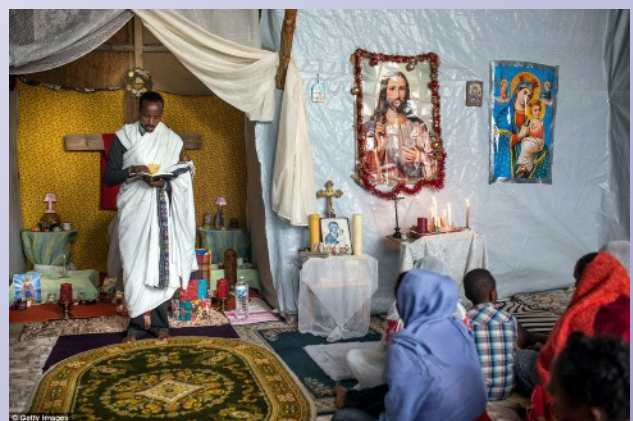
Interior of makeshift at former Calais Jungle

Her theological reflection centred on the NT story of the boat tossed by the storm while Jesus slept. She reflected on the dangerous power of fear which serves evil so well. She drew on the writing of Bonhoeffer when Hitler was elected in 1932 and 1933