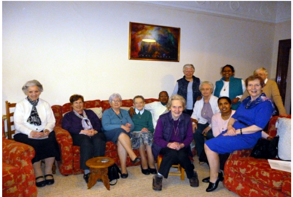
Cluster group at Aberdare, 19 March 2016