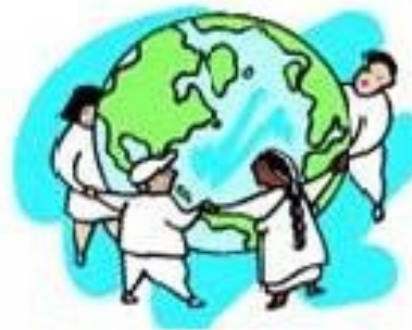
Cardinal Heenan Centre Logo

I am a member of the Education Team and have the responsibility of contacting the Principals and Staff of the Redbridge Secondary Schools to inform them about the situation and to ask them to open their schools to the children of these Syrian families. I have also been asked to liaise with the Bishop and with the Vicar of the Anglican Church in Woodford Green on behalf of TELCO. I am very happy to be the link person between these groups and to see the support we are able to give one another in working towards our common aim – the welfare of migrants.