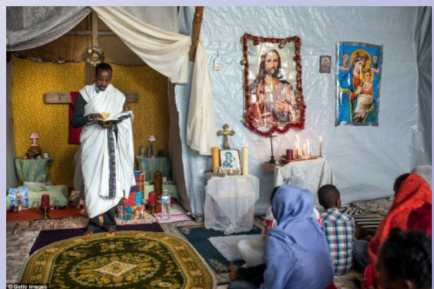
Interior of makeshift chape; at former Calais Jungle

Her theological reflection centred on the NT story of the boat tossed by the storm while Jesus slept. She reflected on the dangerous power of fear which serves evil so well. She drew on the writing of Bonhoeffer when Hitler was elected in 1932 and 1933