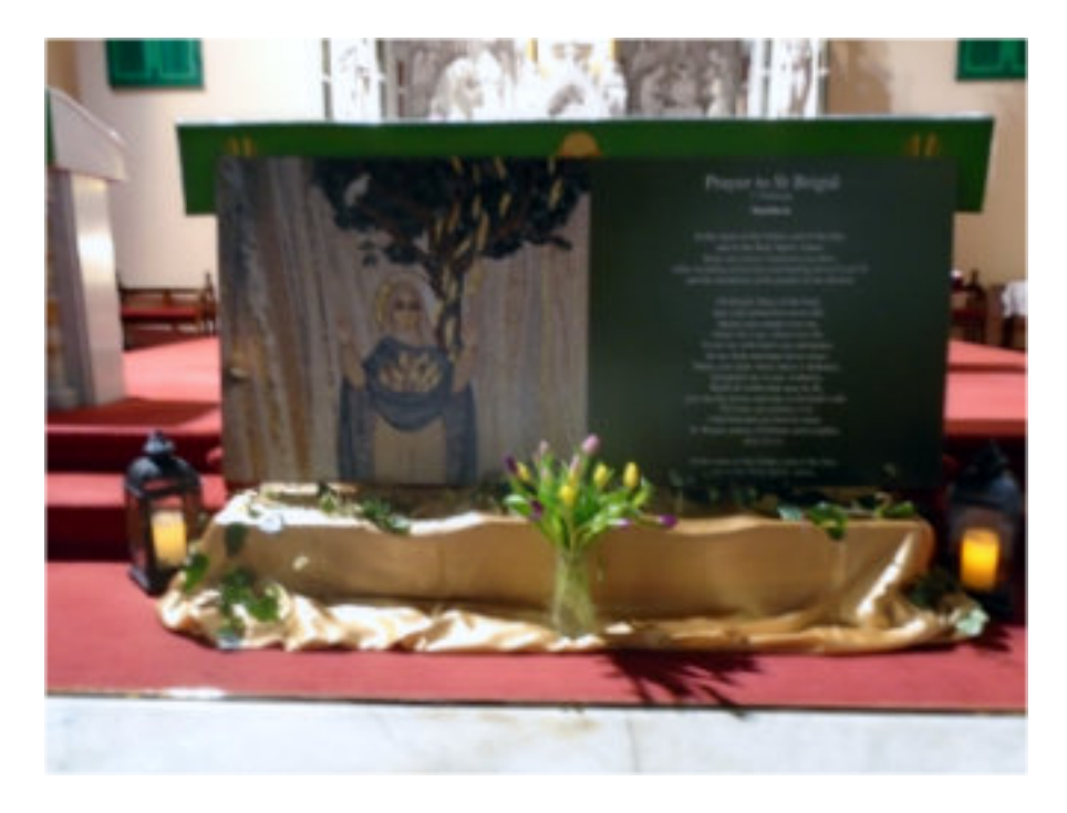
Display before the altar in St. Conleth's Church Newbridge, Co Kildare