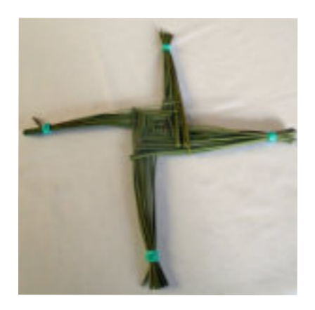
St Brigid's cross crafted by HFSS student