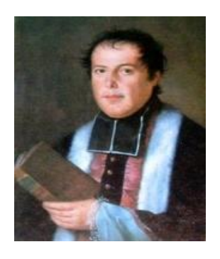
"It is important that each person be himself: that he remain what God

has made him to be, in order to achieve the goal that the divine Creator set for him ... »